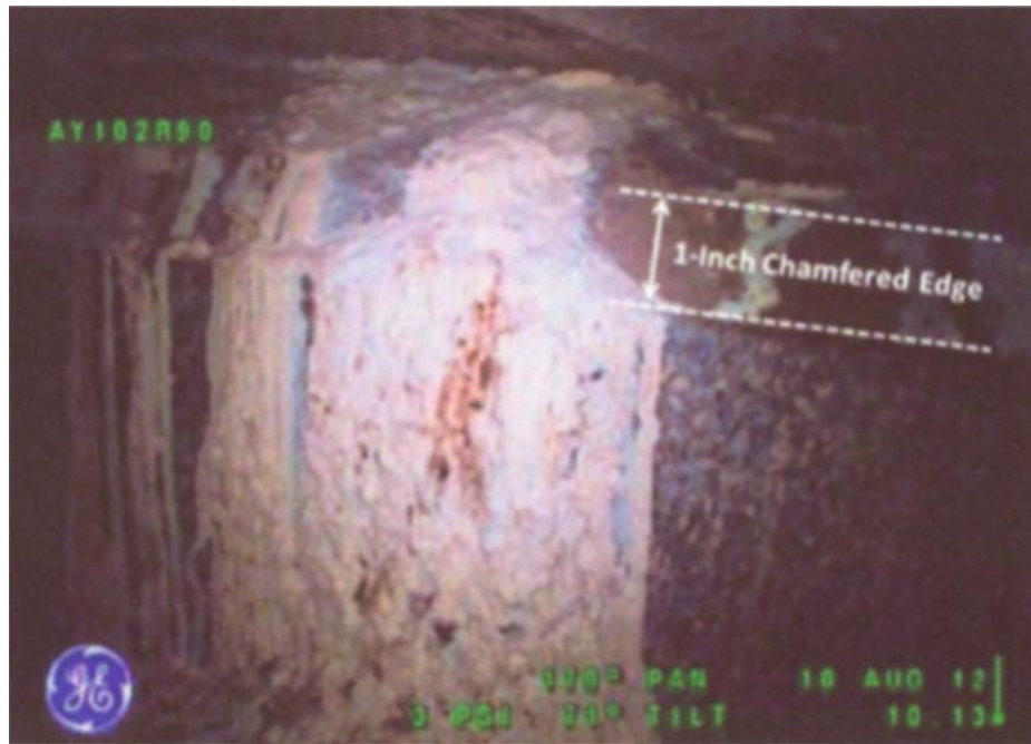
Leaked Waste in Secondary Containment of Tank AY-102

The Board advised DOE that if it chooses to retrieve some of the liquid from the tank, the tank should be closely monitored for signs of increased leakage or blockage of air channels distributing cooling air to the tank bottom. The Board also advised DOE to consider developing an improved thermal model of the tank to aid in understanding the safety significance of any changes observed after removal of liquids.