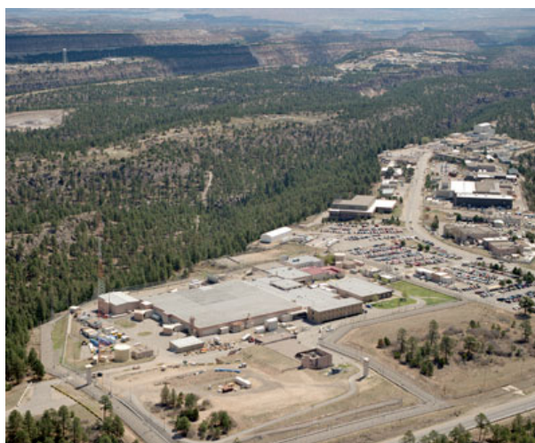
Plutonium Facility (PF-4, in foreground)

On October 26, 2009, the Board issued Recommendation 2009-2, Los Alamos National Laboratory Plutonium Facility Seismic Safety , to focus the attention of DOE and NNSA leadership on the need to address the danger posed by an earthquake and subsequent fire at PF-4. In response, the laboratory undertook a series of actions to improve the safety posture of this facility. These actions included efforts to strengthen the structure of the building and to reduce the likelihood and severity of a post-seismic fire.