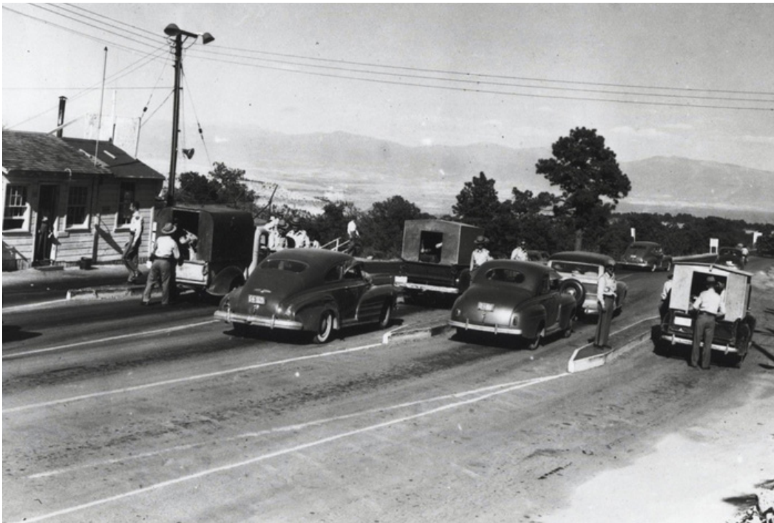
Los Alamos Main Gate, Manhattan Project