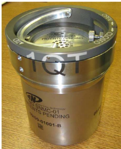
New Plutonium Storage Container

DOE personnel have been developing an update to the September 2009 DOE-wide plan and schedule for implementing the Manual.