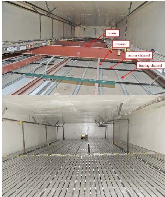
Figure 2: Condition of laboratory ceiling as evaluated (top) and current configuration (bottom).

Fire Suppression System In-Service Inspections —Facility engineers noted that significant portions of the fire suppression system had not been surveyed as part of required ISIs in cases where confined space permits were required for access. LANS procedures allow an exemption for inaccessible spaces, and these areas had been considered inaccessible. This included the service chase above the first floor corridors that allows access to much of the piping above laboratory ceilings. Considering how much of the critical piping is located in these areas, LANL should reevaluate its implementation of these procedures to provide more complete ISI coverage in the future. In subsequent discussions, the facility fire protection engineer said that future ISI procedures will include viewing piping accessible from the service chase. The staff review team believes this is a positive development at PF-4.