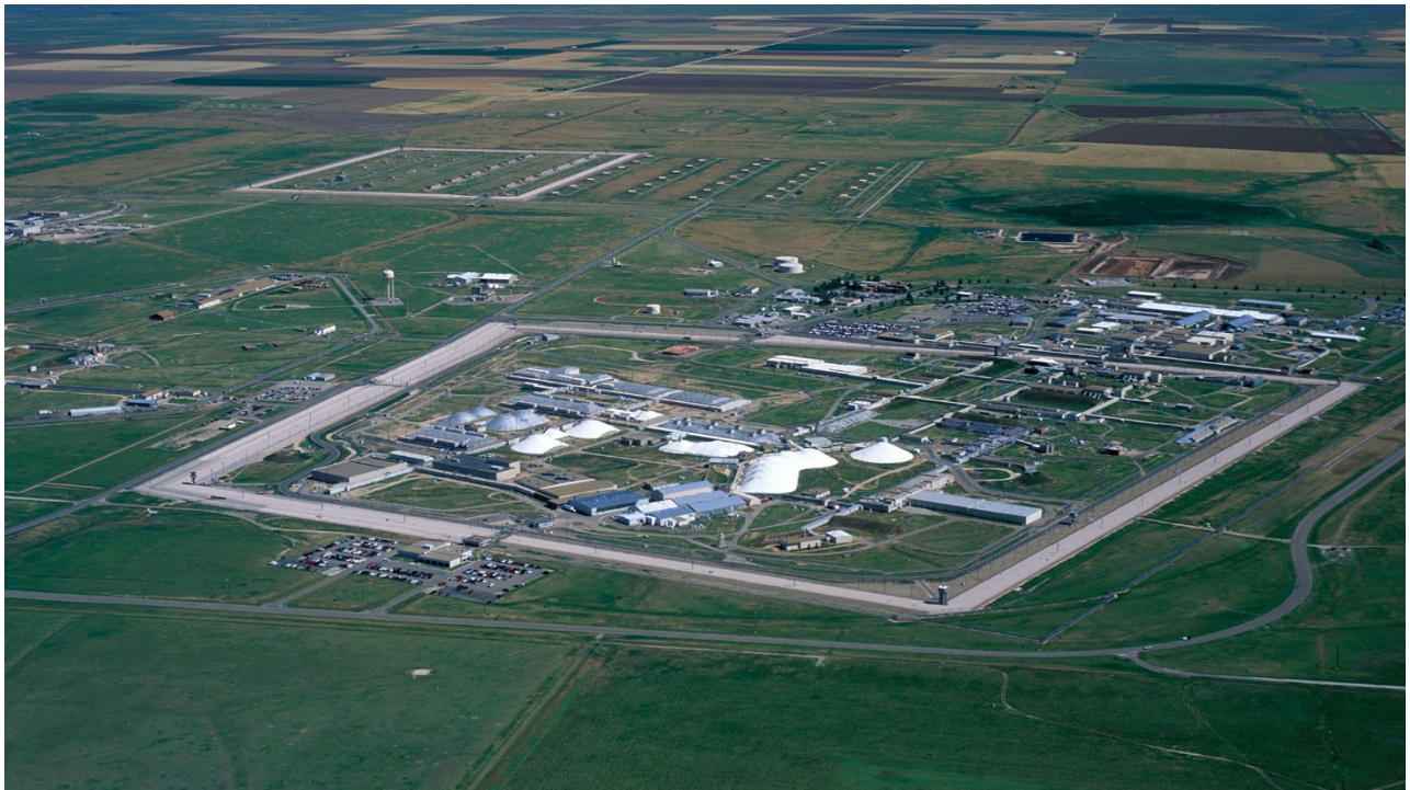
Pantex Plant, Amarillo, Texas