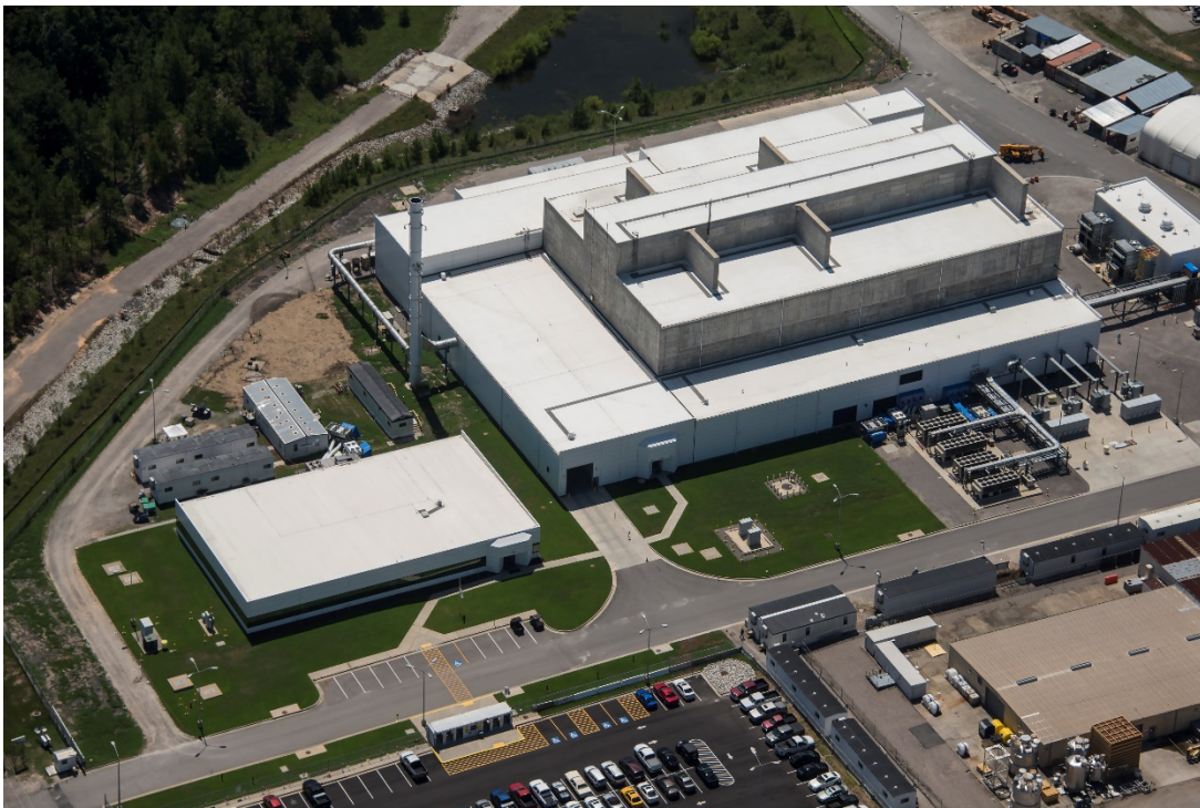
Salt Waste Processing Facility at the Savannah River Site

In November 2019, the Board's staff observed the conduct of the SWPF contractor ORR by which the contractor intended to confirm readiness for safe startup of radiological operations. The contractor ORR resulted in several findings requiring resolution. The DOE Savannah River Operations Office found, however, that the SWPF contractor ORR report identified numerous other deficiencies that were not captured by the ORR findings and that may not be addressed by explicit corrective actions. At year's end, DOE was working with the SWPF contractor on a path forward to address and correct the deficiencies identified by the contractor ORR, as well as other deficiencies identified by DOE. DOE plans to conduct a federal ORR in early 2020 to confirm readiness for SWPF startup. In 2020, the Board and its staff will closely follow the DOE and contractor efforts to make SWPF ready and to start radiological operations.