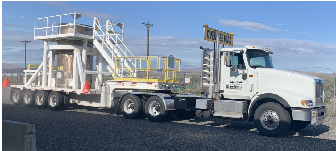
Final Transport of Sludge Container from 105 K-West Basin/Annex

DOE successfully completed this significant project to move the highly radioactive sludge away from the Columbia River at the 105-K West Basin/Annex and into safer storage on the Central Plateau at T-Plant on September 9, 2019. 105-K West personnel expect to ship approximately four more STSCs bearing contaminated sand and garnet filter media in the next