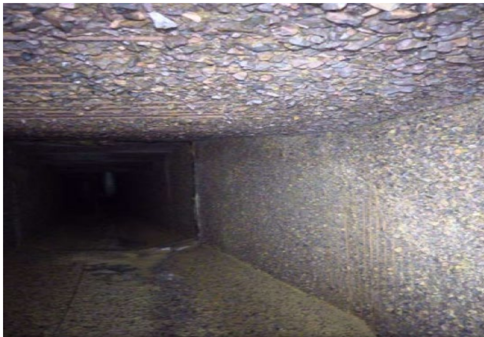
HCAEX Tunnel Concrete Surface Degradation as of 2018

In a December 16, 2015, letter to DOE, the Board identified concerns regarding the structural integrity and degraded state of the H-Canyon Exhaust (HCAEX) Tunnel. As a result, DOE directed its contractor to perform a non-linear fragility analysis of the HCAEX Tunnel to determine the tunnel's adequacy. The analysis determined that the tunnel currently meets the acceptance criteria for the probability of surviving a seismic event, but also notes that there is limited margin under gravity loads for additional degradation beyond the concrete loss considered in the analysis. Consequently, DOE is pursuing an alternative control strategy that would not require the HCAEX Tunnel to survive a seismic event while still assuring adequate protection of the public.