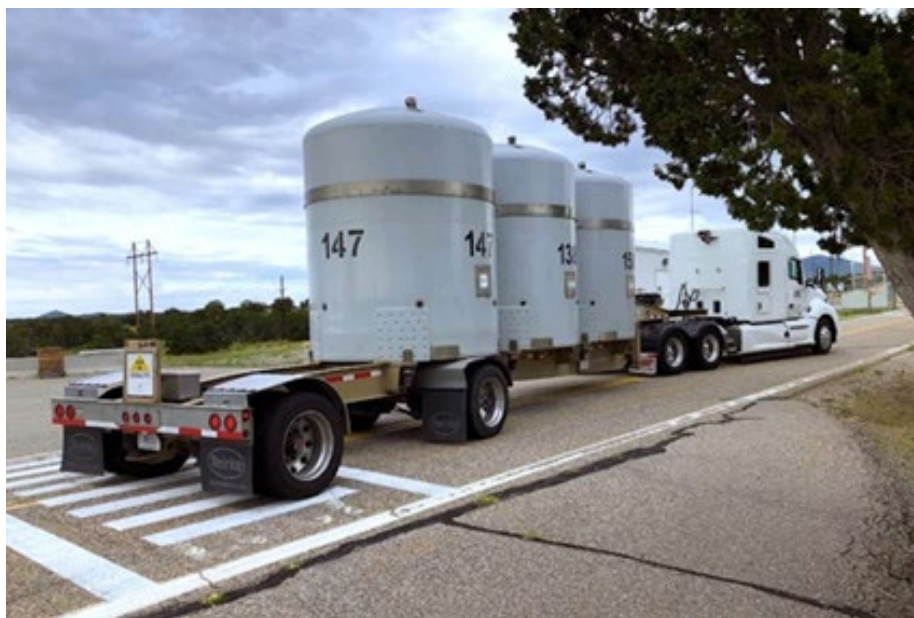
Transuranic Waste Shipment Departing from LANL to WIPP

In a letter to the Secretary of Energy dated December 7, 2018, the Board identified its interest in the alternative strategy evaluation that DOE is conducting, and established a reporting requirement for DOE to brief the Board on the status of the evaluation within 180 days, and to provide quarterly updates thereafter until the evaluation is completed. Briefings were conducted on June 6, 2019, and September 30, 2019. DOE now plans to credit other process equipment with providing adequate containment during a seismic event along with radiological material limits. Thus there will no longer be a need to credit the HCAEX Tunnel as a safety-related control during or after a design basis earthquake. The evaluation is captured in a revision to the H-Canyon Documented Safety Analysis, which DOE approved in December 2019. In January 2020, the Board received a briefing from DOE on its revised safety strategy and the Board's staff will review the revised analysis later in 2020.