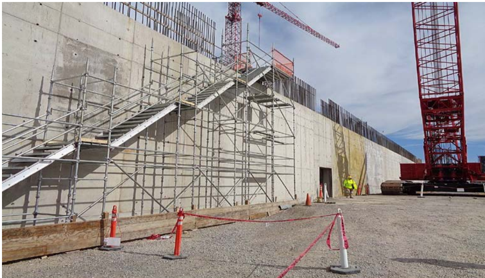
UPF Main Processing Building Construction

In March 2018, the UPF project achieved several crucial milestones by receiving NNSA’s approval for critical decision 2 and 3 for all major sub-projects under the larger UPF project portfolio. This authorized and initiated the official start of construction for all three nuclear building structures and the non-nuclear support building.