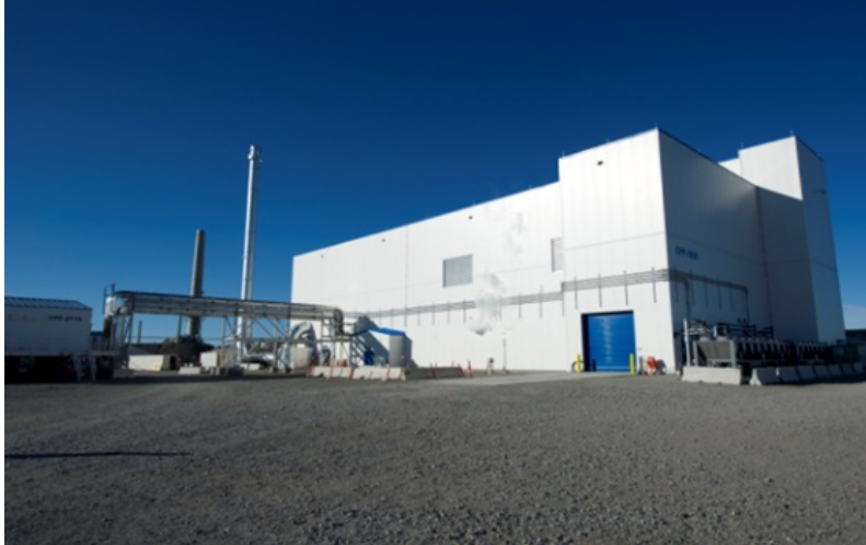
Integrated Waste Treatment Unit