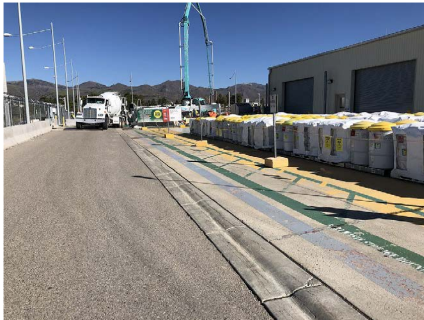
Transuranic Waste Storage Outside of the Plutonium Facility