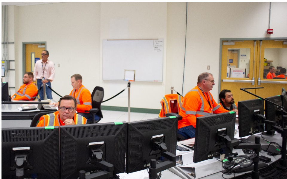
Control Room in the Low-Activity Waste Facility at Hanford

In 2019, the Board's staff also reviewed the safety instrumented systems that will be used in the LAW facility. Based on the information reviewed, the Board did not identify any safety issues in this area. The Board will continue to follow DOE's effort to complete the development of these systems and their associated surveillance methodologies.