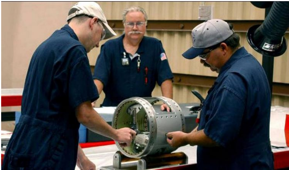
Weapons Manufacturing Operations at the Pantex Plant

NNSA responded on September 23, 2019, acknowledging its previous acceptance of the recommendation, noting the implementation plan included detailed commitments to address the Board's safety concerns, and offering a briefing on the implementation plan and suite of other improvement actions. The Board accepted NNSA's offer for a briefing in its letter of October 28, 2019, but maintained its position that NNSA's implementation plan constituted rejection of the recommendation. In its letter, the Board provided detailed concerns with the implementation plan, including the following areas: (1) federal ownership, (2) unaddressed sub-recommendations, (3) insufficient scope in implementation plan actions, (4) responsiveness to root causes, and (5) future action plans as implementation plan deliverables. The Board held a public meeting on the implementation plan on December 12, 2019. NNSA personnel briefed the Board on the implementation plan and planned improvement activities. During the public meeting, NNSA personnel committed to revise the implementation plan to address the Board's concerns.