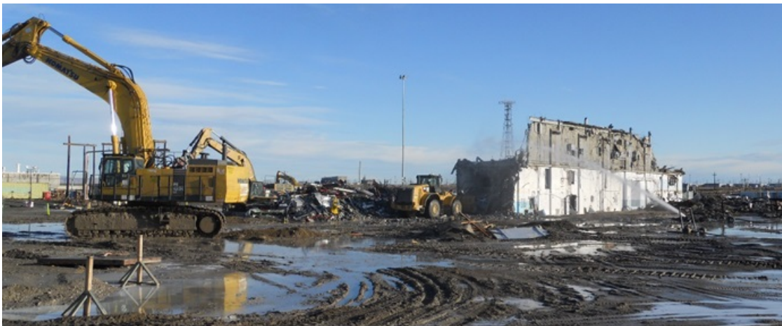
Demolition Operations at the Hanford Plutonium Finishing Plant

In December 2017, DOE suspended demolition activities at PFP following a spread of contamination beyond radiologically controlled areas. In conjunction with the State of Washington and the Environmental Protection Agency (both of which have jurisdiction over aspects of the activity), DOE lifted the work suspension in September 2018, after completing the corrective actions, and resumed lower-risk PFP demolition work. In 2019, the Board's oversight of the demolition activities focused on DOE's control of the contamination and the corrective actions DOE established to avoid recurrence of the conditions resulting in the contamination spread event. In April 2019, the Board's staff observed and evaluated the management assessment for the resumption of higher-risk PFP demolition work. The Board and its staff continue to monitor ongoing demolition and debris removal activities as the project enters the final phase of demolition.