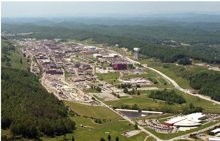
Y-12 National Security Complex

The Board encouraged the Secretary of Energy to use the information from the staff's review to address the deficiencies and make improvements to the Y-12 NCS program. On August 23, 2019, the Board sent a letter to the Secretary of Energy requesting a detailed briefing on actions taken to address feedback from reviews conducted of the Y-12 NCS program; roles and responsibilities of the federal staff in conducting oversight of nuclear criticality safety; and expectations of its field office personnel in ensuring the safety of its federal and contractor workforce. In October 2019, because of the Board's concerns, the full Board conducted its first trip in several years to receive this briefing on-site and to conduct field observations of Building 9212. The Board remains concerned with the criticality safety program, particularly the operators' understanding of and compliance with the program, and will continue to review the Y-12 NCS program in 2020.